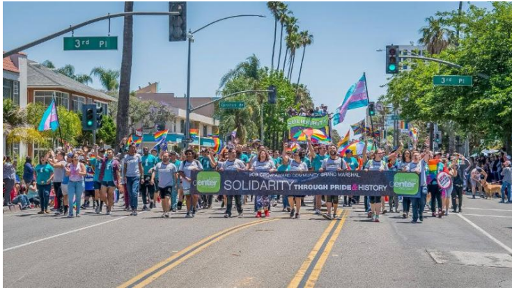
Long Beach Pride '16