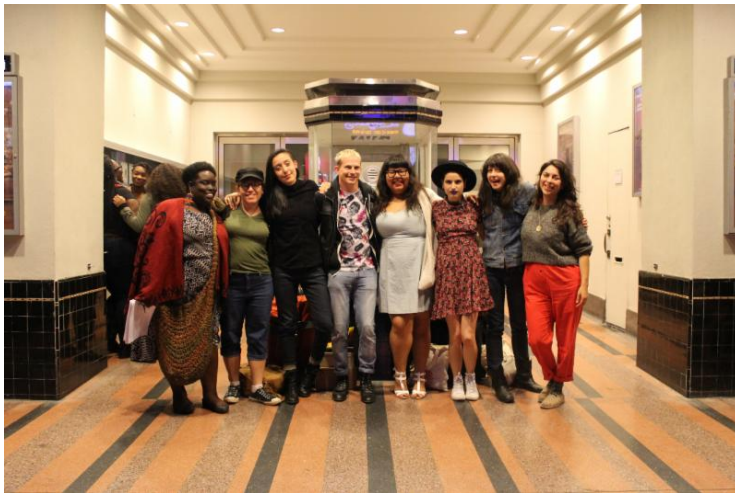
The Center Hosts: Sister Spit 2016