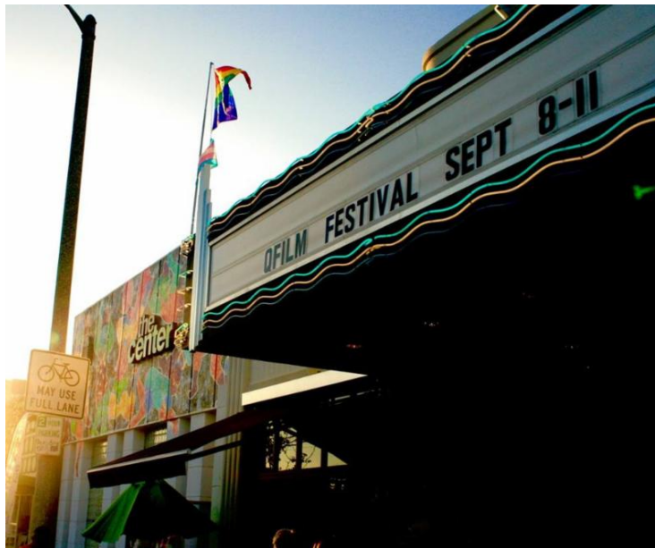
The 2016 QFilm Festival